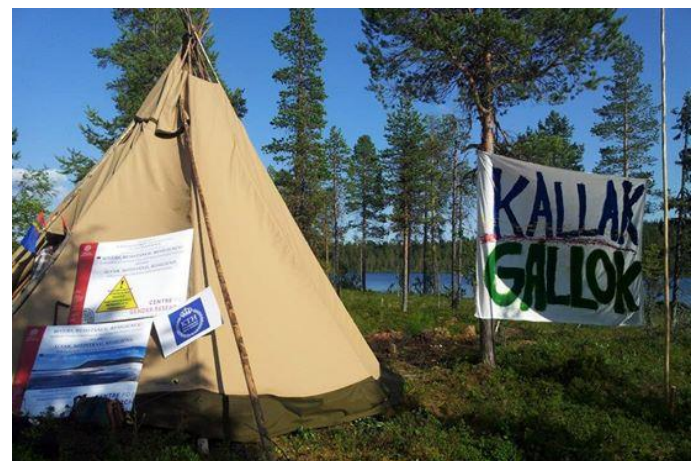
The University goatje at Kallak – Gállok, July 2013.

Travel grant from Barbro Osher Pro Suecia Foundation.